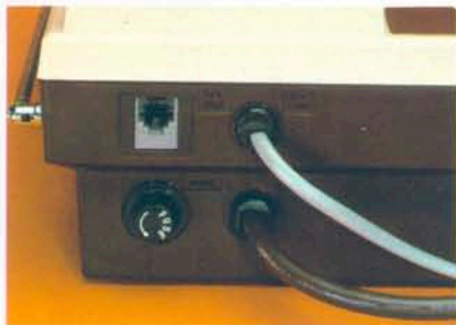
Built-in Phone Jack

CALL-ON-HOLD INTERCOM allows the person at the base station to put an incoming call on hold, page and talk to the person with the portable phone -- all while the incoming caller remains on hold, unable to hear the conversation.