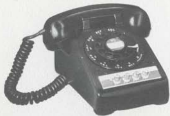
Four Push Button K-544