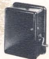
Hand Generator Boxes No. 1203 3-Bar. No. 1205 5-Bar. No. 1206 6-Bar.