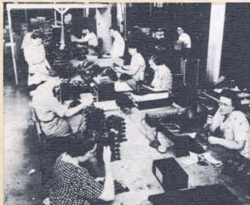
Here the interconnecting blocks and ringers are mounted to the base plates and the potted condensers and induction coils are plugged into the interconnecting block.