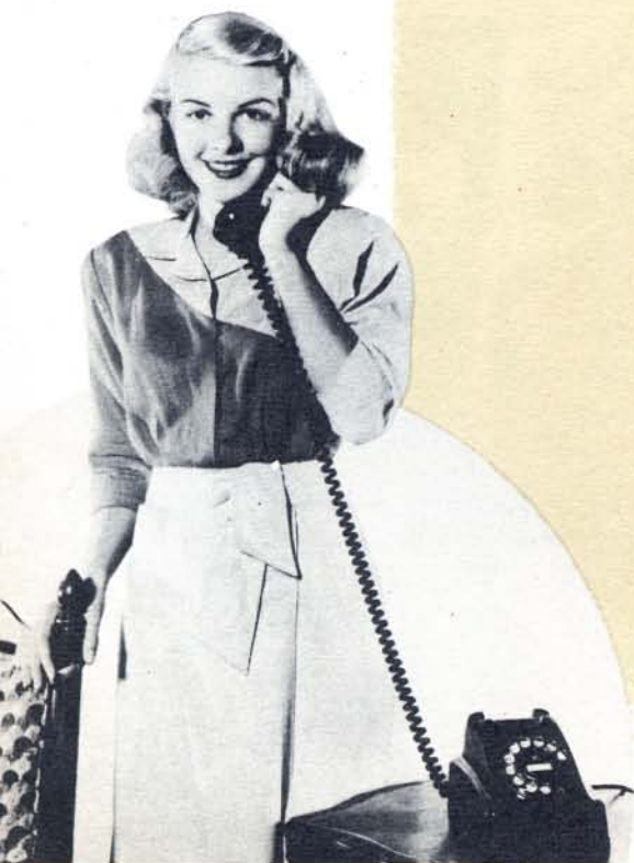
Barbara Bates appearing in the Hal Roach Cinecolor feature comedy "The Fabulous Joe."