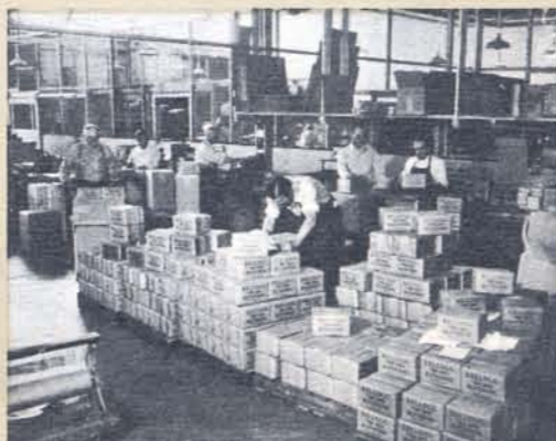
Soon these Masterphones will be providing dependable, trouble-free low cost service in thousands of homes and offices throughout the country.

Modern industry recognizes through long experience that efficiency is the most vital factor in gaining and holding customer satisfaction. Kellogg efficiency has been typically reflected in the production of the 1000 Series Masterphone. The Masterphone is the pacesetter for continued high instrument standards, having behind it the skills and foresight which fifty years of service and progress can not but help to bring. If it's the best you want, you want the Masterphone.