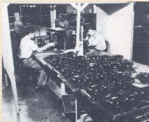
Final inspection of the complete instrument is as thorough as the first raw material tests that are made in the extensive Kellogg Laboratory.