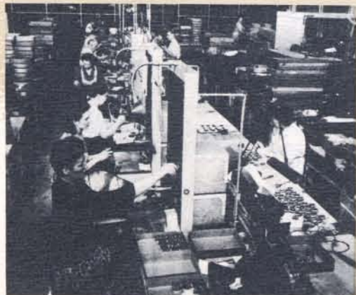
The receiver, most sensitive component of the Masterphone handset, includes 22 parts—some so delicate that they are assembled under a magnifying glass.